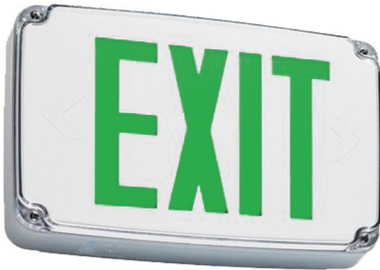
Green LED Letters Available