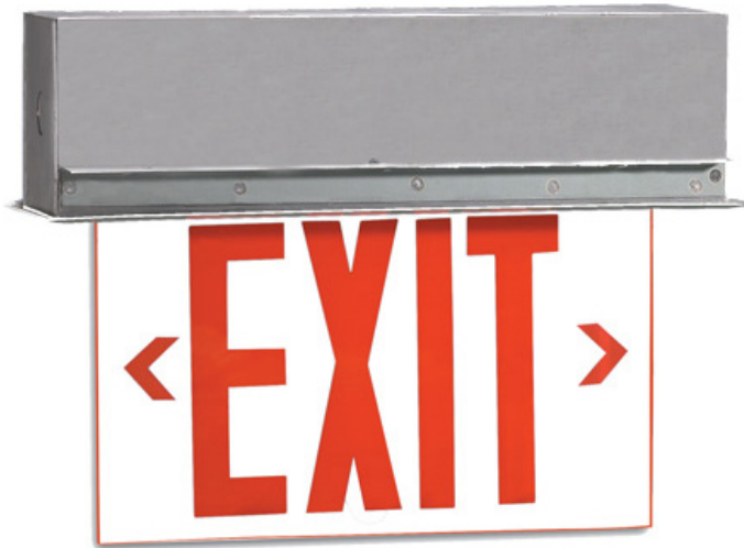
recessed drywall mount