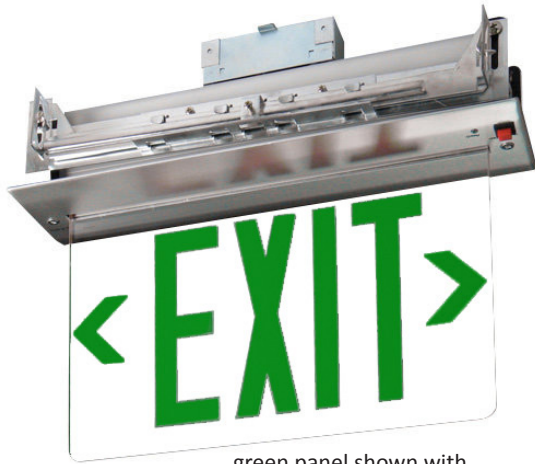
green panel shown with recessed t-bar grid mount