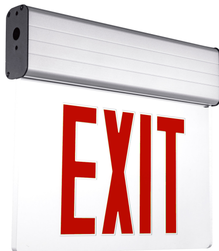
surface wall/ceiling mount

The battery backup model for the EDGE is outfitted with a maintenance free, nickel cadmium exit sign battery. The battery features a 24-hour recharge time and provide 90-minutes of emergency run time. Comes standard with a current charge regulator. Simply press the external test button to satisfy monthly and yearly testing requirements.