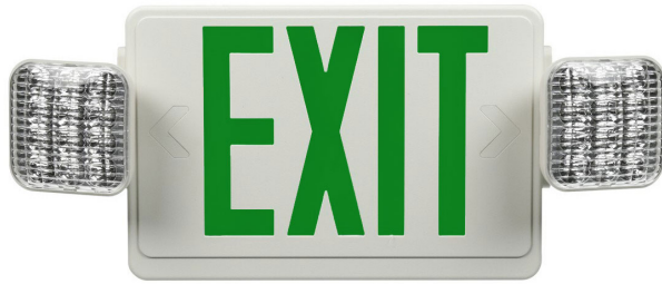
MINI-CSQ Exit Sign Combo - Green Letters