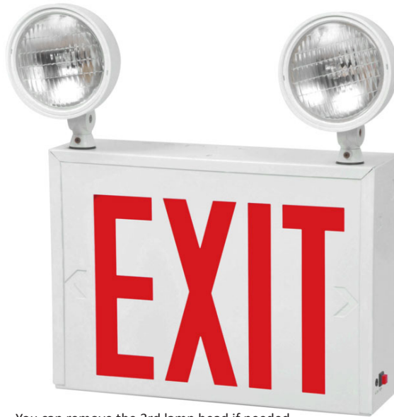
You can remove the 3rd lamp head if needed