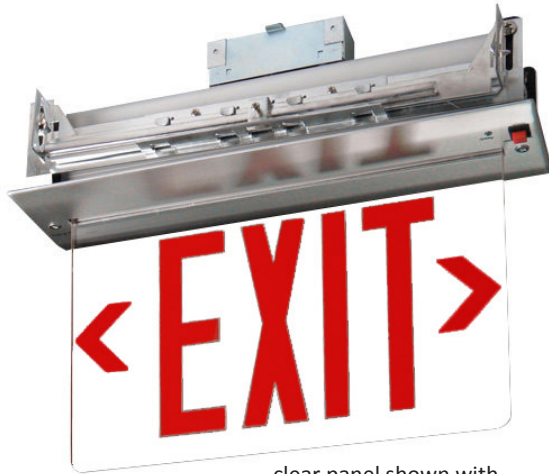
clear panel shown with recessed t-bar grid mount