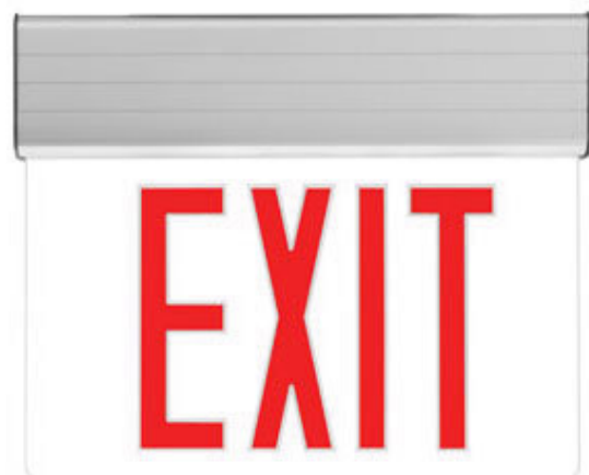
surface wall/ceiling mount

The battery backup model for the NY-EDGE is outfitted with a maintenance free, nickel cadmium exit sign battery. The battery features a 24-hour recharge time and provide 90-minutes of emergency run time. Simply press the external test button to satisfy monthly and yearly testing requirements.