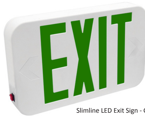
Slimline LED Exit Sign - Green Letters