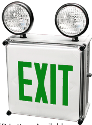
Green LED Letters Available